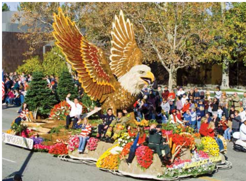
The Tournament of Roses Parade in Pasadena is a spectacle of sounds and sights for visitors of all ages