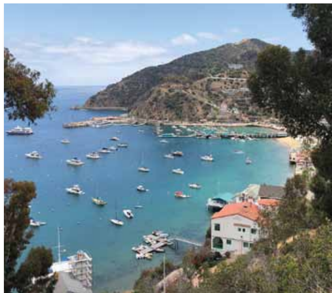
If you're up for a climb you can take in the birds-eye view of Avalon Bay