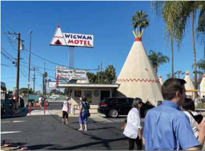
Our recent Route 66 in California trip included a stop at the Wigwam Motel