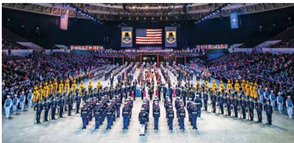
The Virginia International Tattoo brings together military bands, singers and dancers from all over the world, but with a decidedly Scottish flair

Gift Certificates can be purchased from our office, in person or over the phone, in any amount. Office hours are 9am – 3:30pm, M-F.