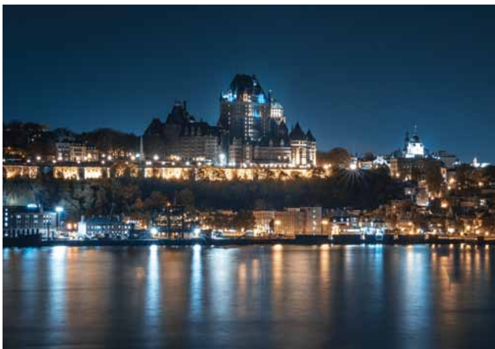
Few places are more romantic than Quebec City at night

We will be closed Christmas Eve, Friday, December 24