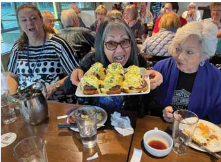
No one ever goes hungry on a Sports Leisure trip!