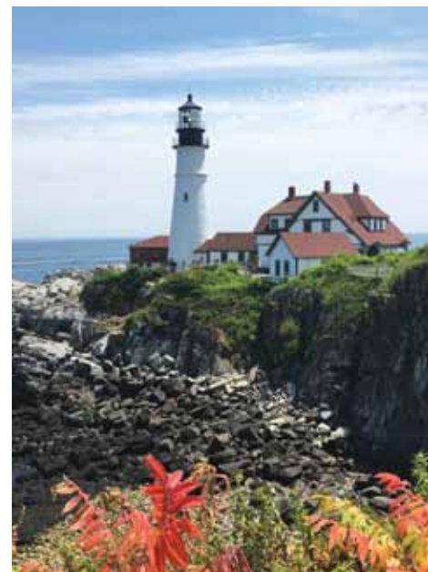
See Portland Head Lighthouse on the rugged coast of Maine