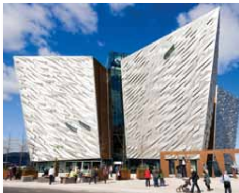
Visit the Titanic Museum in Belfast, located in the shipyards where the ill-fated ocean liner was built

Clayton's Note: See details on page 30 of our 2022 Dream Book and online. This tour is in the final planning stage. We expect the price to be available before the end of the year.