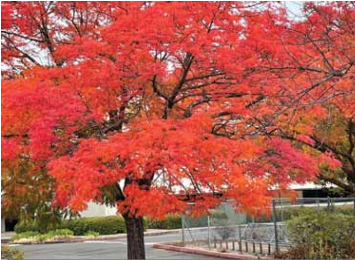
The fall colors in our parking lot can compete with New England some years, this being one of them