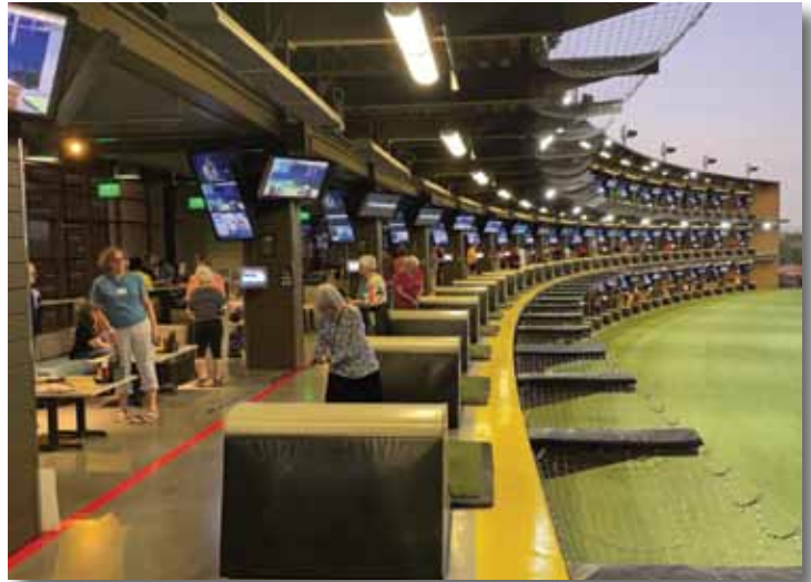
Turns out one of the stops was a driving range...for golf balls...one lady hit her husband with a five-iron and a bucket of balls...