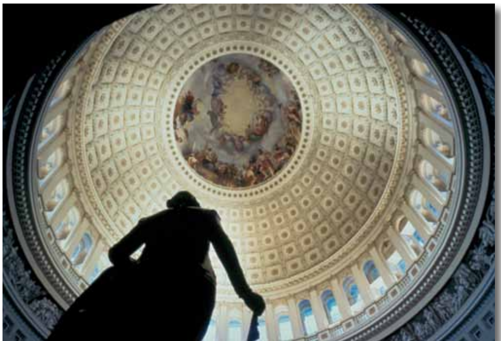
See what's under the dome of YOUR nation's capitol building on a guided tour