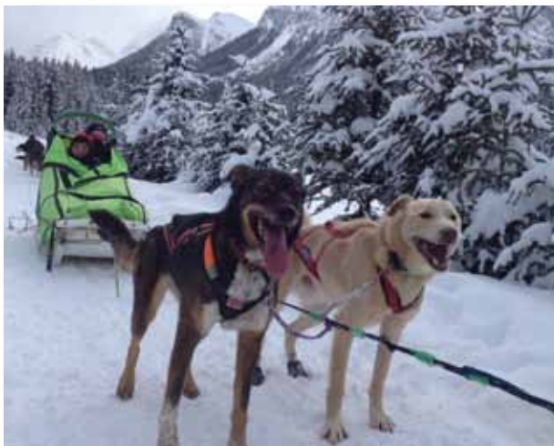
Dog Sledding at Lake Louise, Banff, Alberta