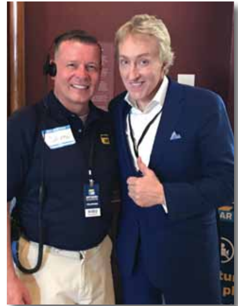
Leigh Keno (sans twin brother Leslie) was amongst the celebrity appraisers when "Antiques Roadshow" rolled into town in May