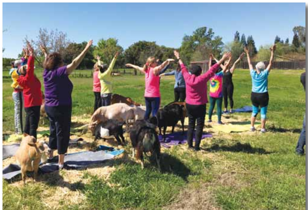
The KVIE Mystery Daytrip took us to a goat yoga class being filmed for an episode of "Rob on the Road"