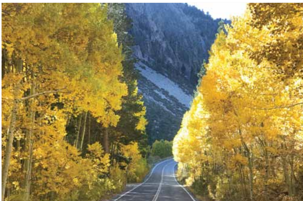
Travel the roads of the Eastern Sierra through tunnels of color