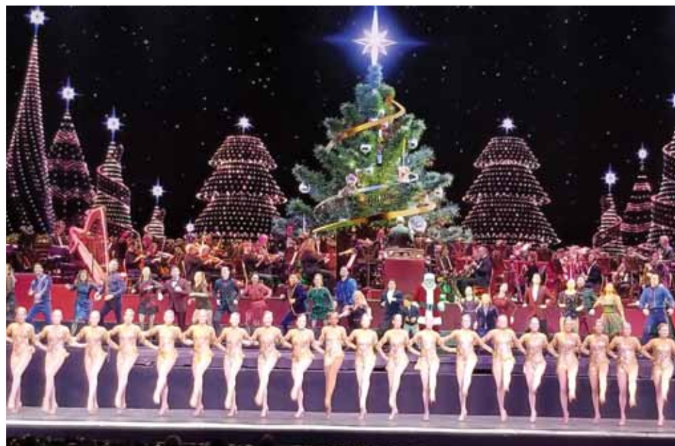
Rockettes Christmas Spectacular, New York City