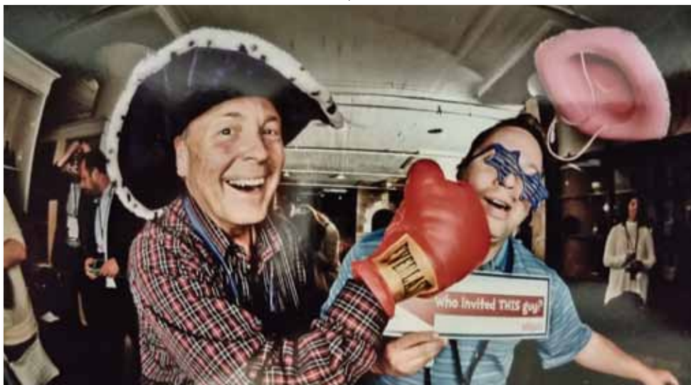
The new "employee disciplinary program" has started at Sports Leisure Vacations

Questions about beds? Just inquire at the time of reservation . Rooming lists are sent to hotels 4-6 weeks prior to arrival, so avoid last minute requests, as those have a lesser chance of being honored.