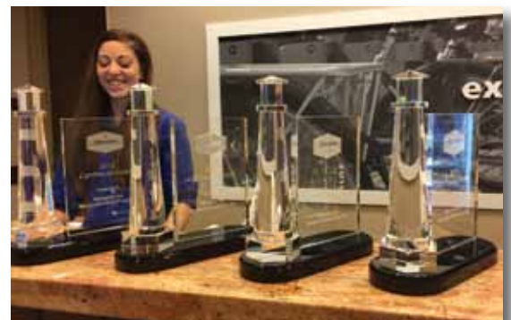
We choose award-winning hotels for our travelers. Here, the Hampton Inn on the waterfront in Marquette, MI displays its "hardware," top 5% of Hampton Inns every year they have been open. Part of our Pure Michigan tour.

Seating in the arena (we have three seats available ) is at the top of the lower level, near center ice. They are in an excellent location , providing a great view with a minimal number of steps, and great access to rest rooms and concessions. Travel by coach to/from San Jose, making this the easiest way ever to see the best skaters in the country compete.