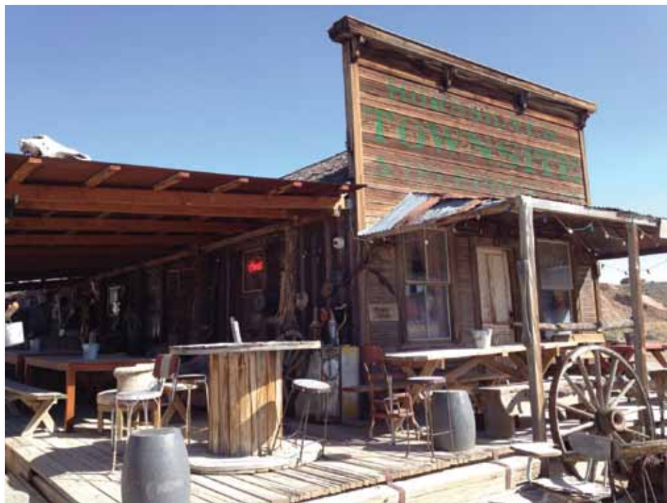
Explore the Ghost Towns of Old Nevada: No two are alike!

Sports Leisure online: You are invited to visit our website at www.sportsleisure.com for more information on any tour listed here, or call our office and we will be happy to send you a detailed itinerary.