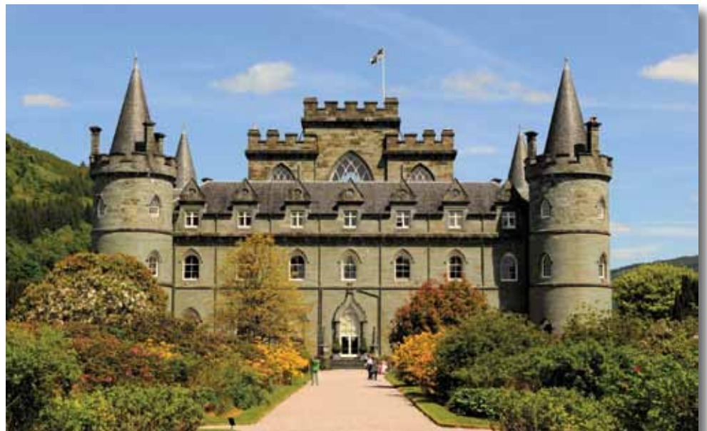
Take the high road or the low road to discover Inveraray Castle in Scotland

4. Explore the Royal Yacht Britannia which served the Royal Family over 44 years of distinguished service. In the evening, Prestonfield House plays host to the Taste of Scotland Show featuring a mix of traditional