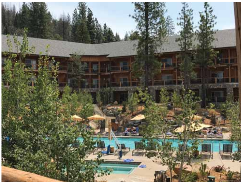
Experience the newest mountain resort in the Sierra Nevada during your visit to Yosemite