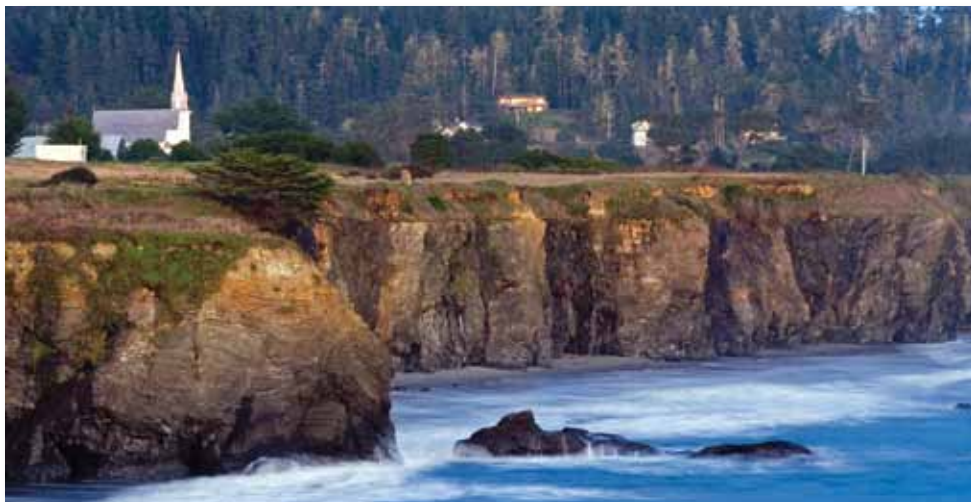
The quaint village of Mendocino rests on a high bluff overlooking the Pacific Ocean

This vacation requires a valid passport!