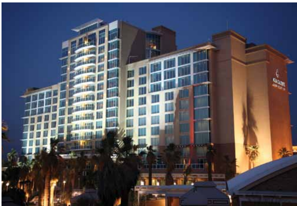
Stay three nights surrounded by luxury in the desert at the Agua Caliente Resort