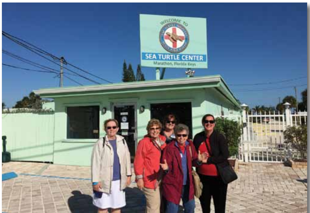
Our Key West trip always tours The Turtle Hospital to learn how we can be better friends to marine life

This vacation requires a valid passport!