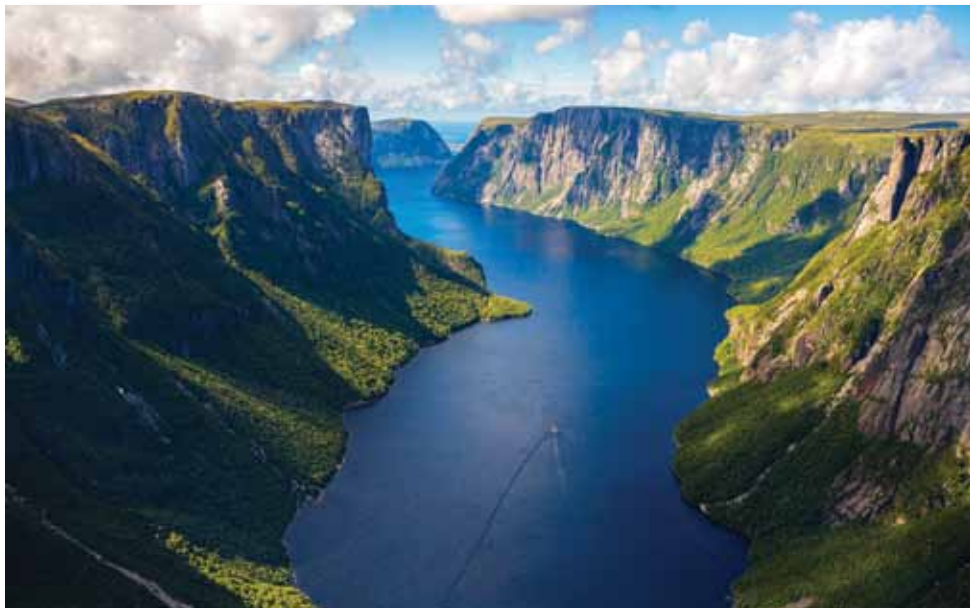
See that small speck in the water? That's you on a cruise through Western Brook Pond Fjord in Newfoundland