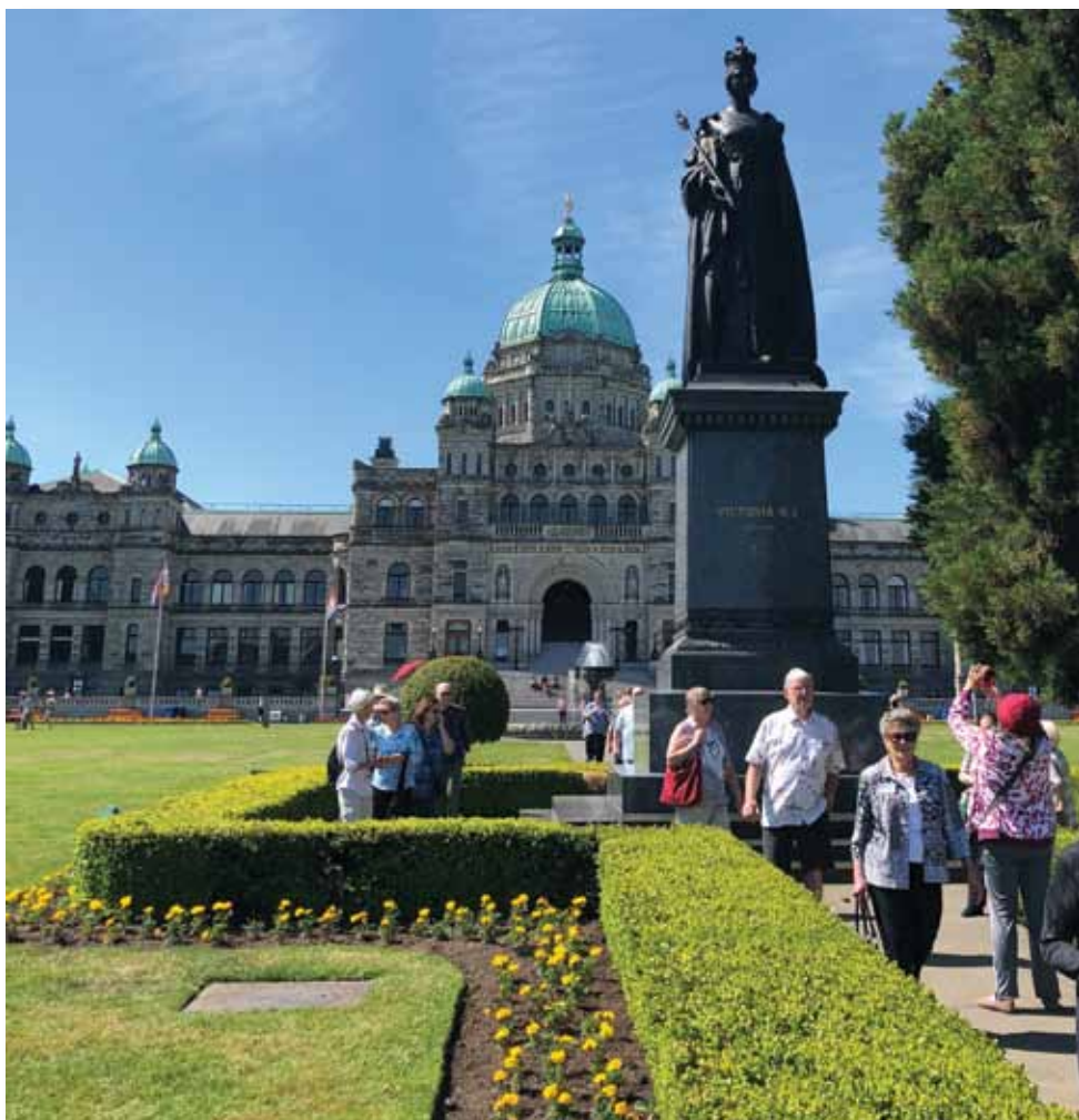
Experience the Parliament Building and all things British (Canadian-style) in Victoria

I wish everyone a very happy, healthy holiday season! I'm excited to celebrate Christmas at the beautiful Davenport Hotel in Spokane where Eggnog the Elf (me in green tights is a sight to behold!) will make his annual appearance to help Santa with the White Elephant gift exchange. Afterwards, I'll ring in the new year in sunny Pasadena at the 130th Rose Parade, then it's off to Hawaii and Key West with you. I welcome 2019 and the chance to continue sharing wonderful experiences and creating lasting memories together. Hope to see you on the road soon!