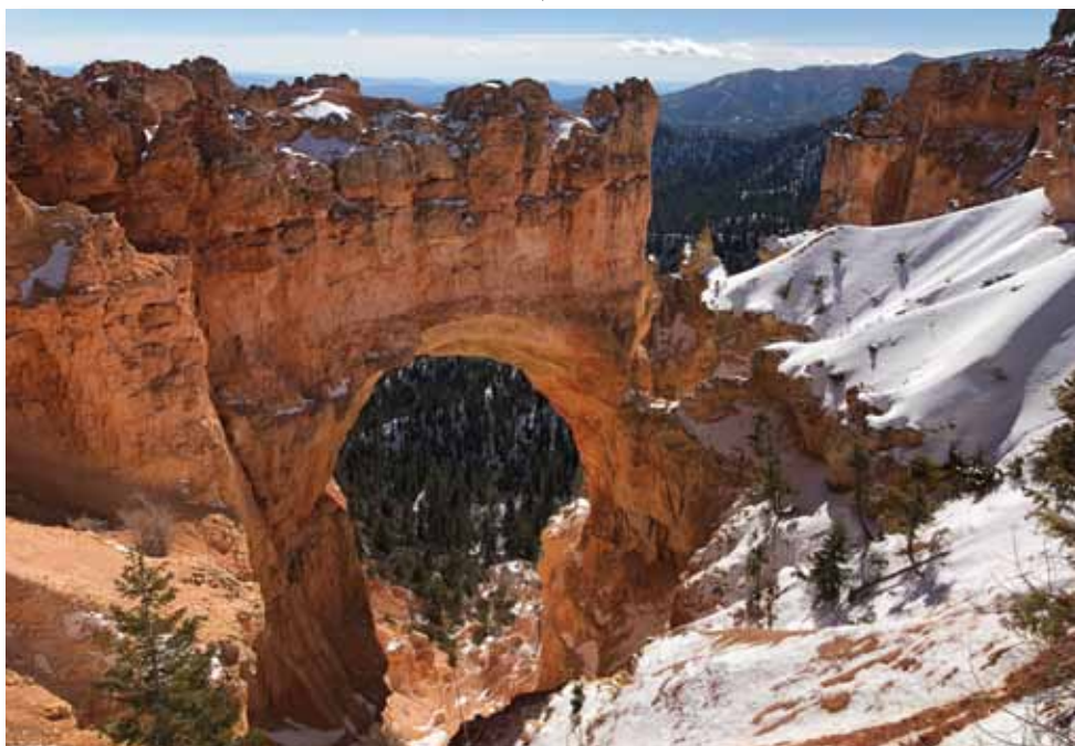
The Natural Bridge in Bryce Canyon is highlighted by a dusting of winter snow