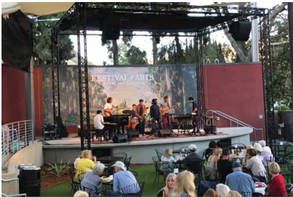
Live music adds excitement to the air prior to the performance of the Pageant of the Masters