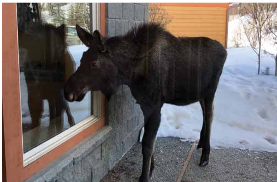
A local visits our hotel in Talkeetna last year during the Scott's Alaska Aurora Borealis trip