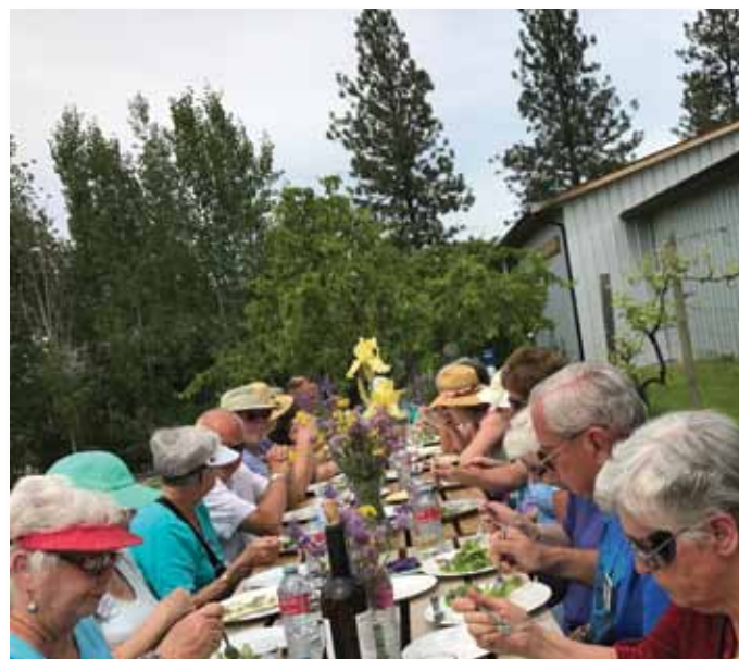
Dine al fresco on the bounty of the Okanagan