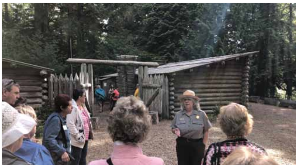
A park ranger addresses SLV Travelers at Fort Clatsop, home of the Lewis & Clark Expedition in 1805-6