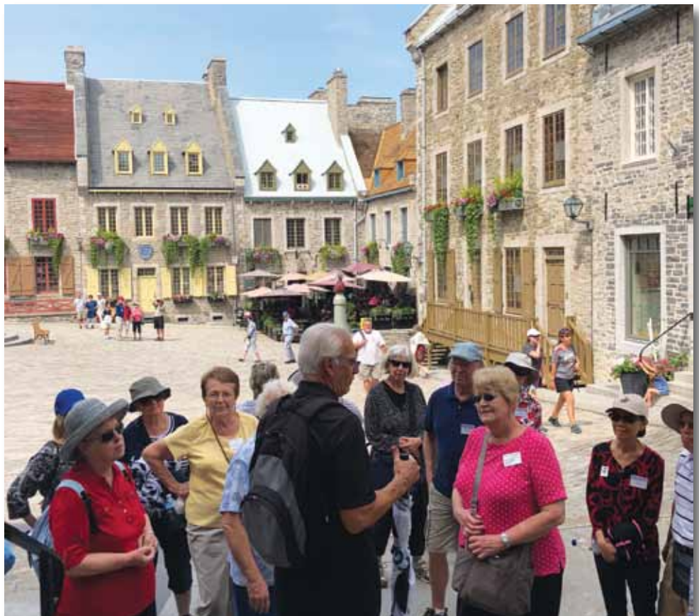
A guided tour of Old Québec is a journey through time and cultures