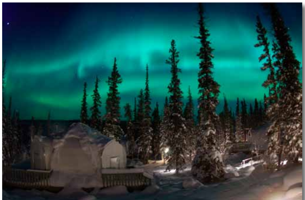
The aurora borealis are both eerie and fantastical on Scott's Alaska trip

3. Wake up and look out your window and hopefully view the majestic Alaska Range