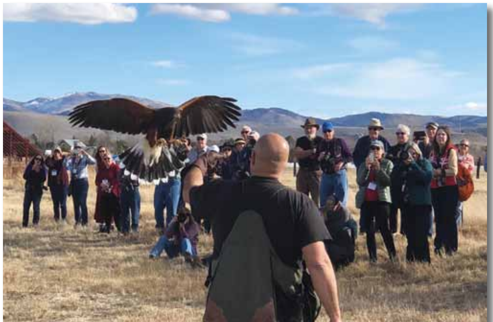
Local wildlife experts demonstrate the skillful birds of prey in Carson Valley