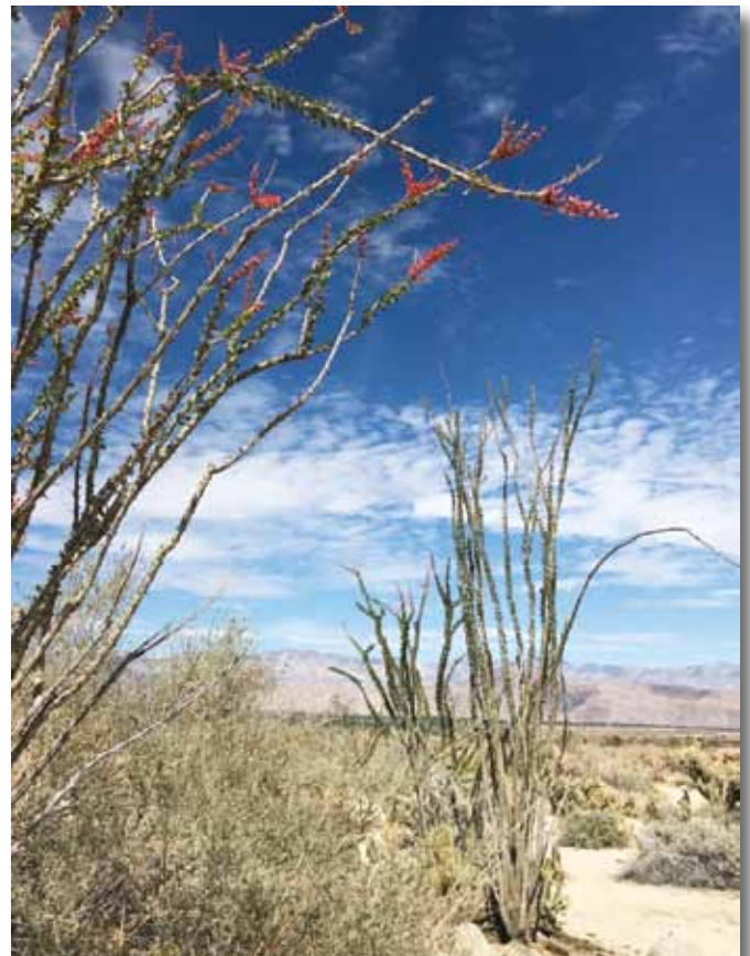
Ocotillo in bloom is just one of the many beauties found in the desert

4. Two distinct desert ecosystems, the Mojave and the Colorado, come together in Joshua Tree National Park. Forests of trees and jumbles of massive rocks make this an enchanting place – a land sculpted by strong winds and torrents of rain. The surreal geologic features add to the mystique of this vast wilderness. This evening you have the option to stroll through Village Fest, a