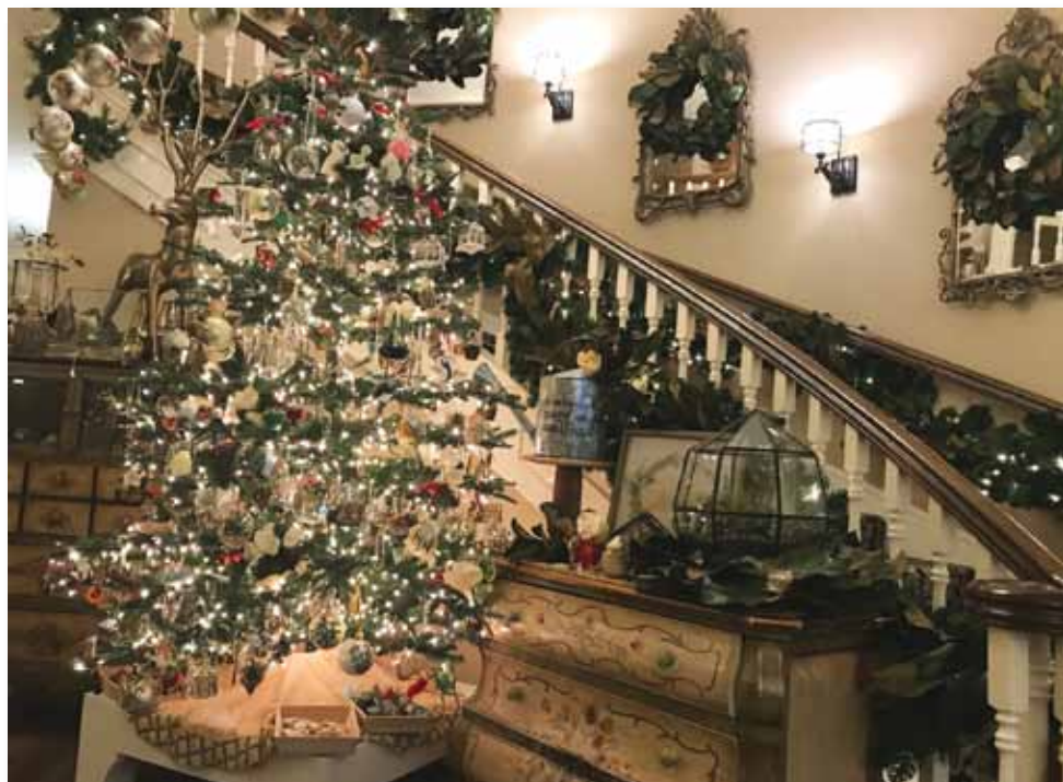
At the Apple Farm Inn, they take the song “Deck the Halls” literally... Enjoy the festive surroundings