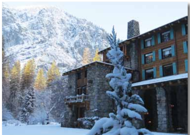
Awaking to a fresh snowfall while at the Ahwahnee Hotel is magical

Face masks required on coach: protect others, protect yourself!