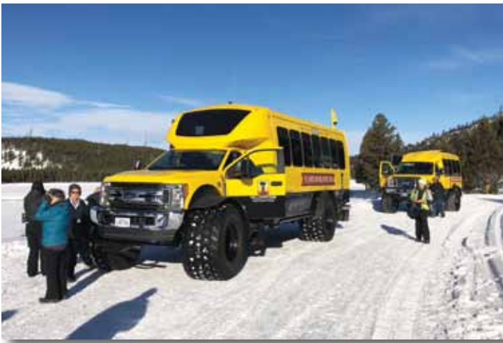
Join Scott on a winter adventure to Yellowstone "Ride the big Yellow Sno-coach"

hosted before traveling to Gardiner situated at the North entrance of Yellowstone National Park. Ridgeline Hotel (L)