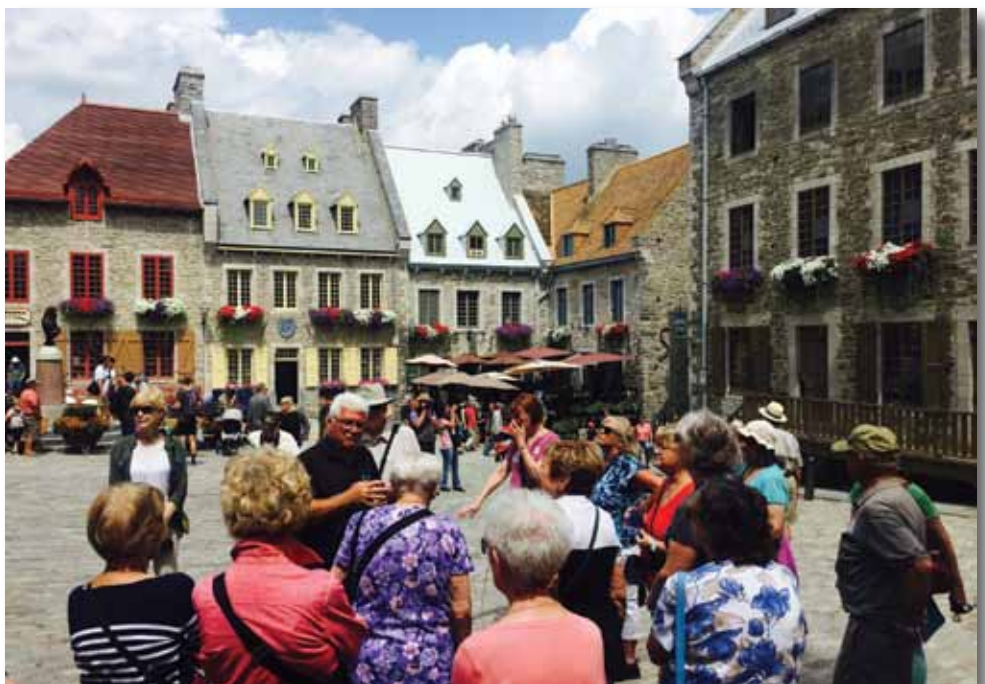
Explore the cobblestone streets of Old Quebec City with a local guide