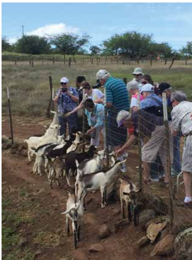
Meet the "kids" at Surfing Goat Dairy Farm on Maui