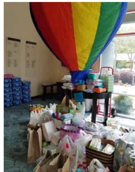
Those attending Preview Day helped create a small mountain of needed items for others in the community. Then, Loaves & Fishes came and whisked them away.

location. For details on the new stops, see The Barber Pole , on page 7.