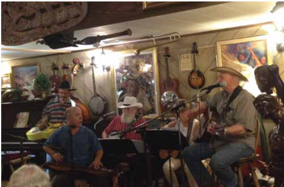
Join the local residents for a night of live music at the Hotel Ymir