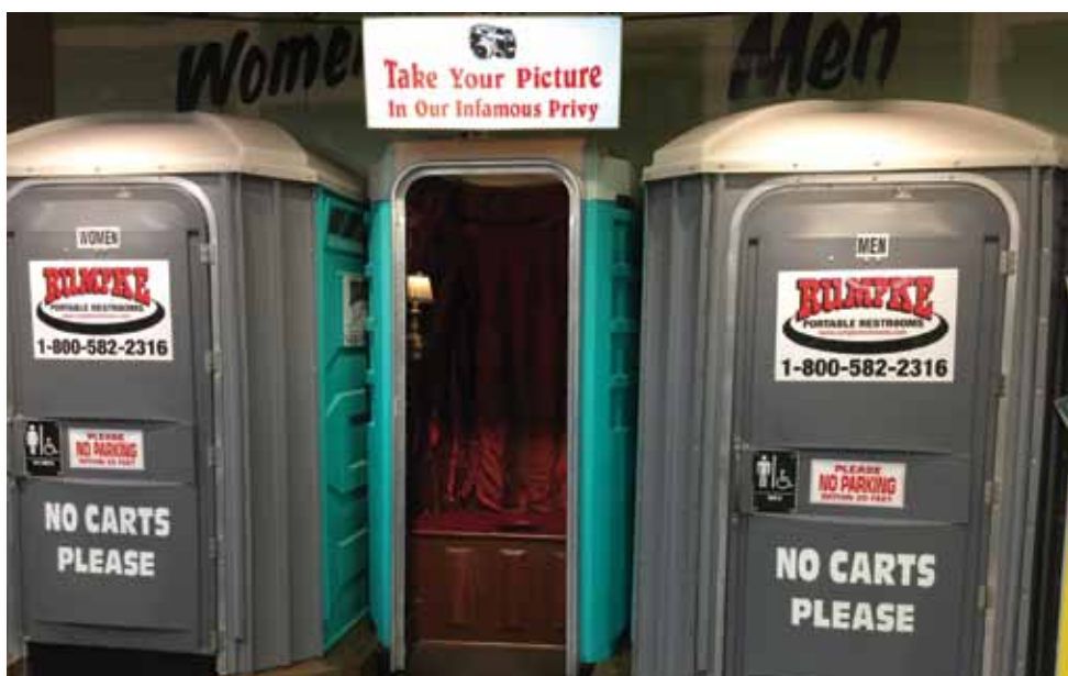
On Mystery Tours, you'll enjoy the finest "accommodations." This is an actual photo from one of the stops on the trip. (Despite what appears, they are NOT porta-potties. Or so they say...)