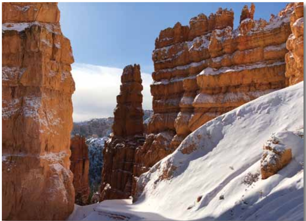
Seeing Bryce Canyon at its winter's best, will make a lasting memory

1. Fly direct on Southwest Airlines to Salt Lake City. Travel through the Wasatch Mountains to the town of Midway. Your resort features a unique attraction the one-of-a-kind Homestead Crater. Take a soak in this geothermal spring, hidden within a 55-foot tall, beehive-shaped limestone rock. Tonight, also on property is the Ice Castles featuring ice-carved tunnels, frozen thrones, and towers that reach astonishing heights. LED lights frozen inside 25 million pounds of ice twinkle adding a magical ambiance