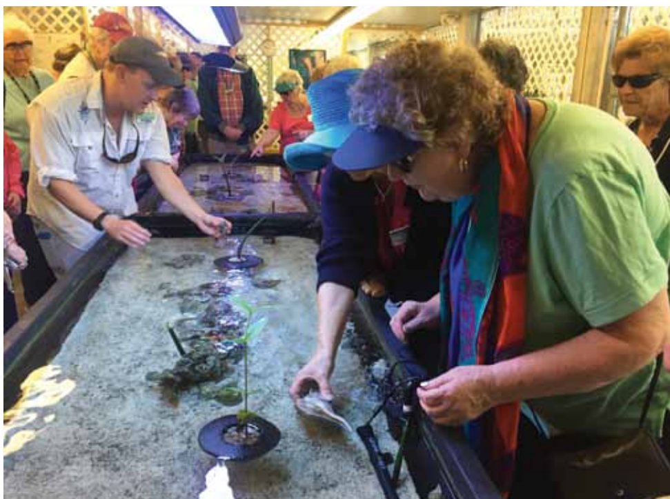
Get a hands on lesson about Florida's Gulf Coast Ecosystem on Sanibel Island

4. Head to Sarasota and The Ringling Museum. Does that name sound familiar? It should! Mr. Ringling ran the circus in the