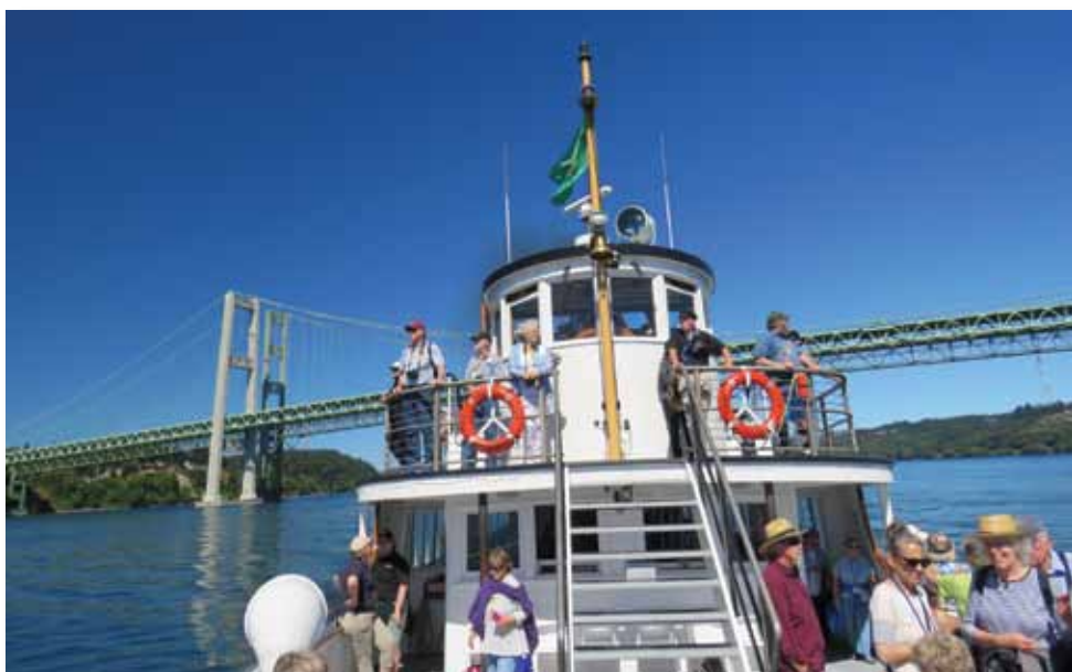
Cruise under the famous Tacoma Bridge and pass the islands of the southern Puget Sound, aboard the historic Virginia V

3. Back to the launch field this morning to capture some more spectacular photos and pick up that last minute souvenir. We head