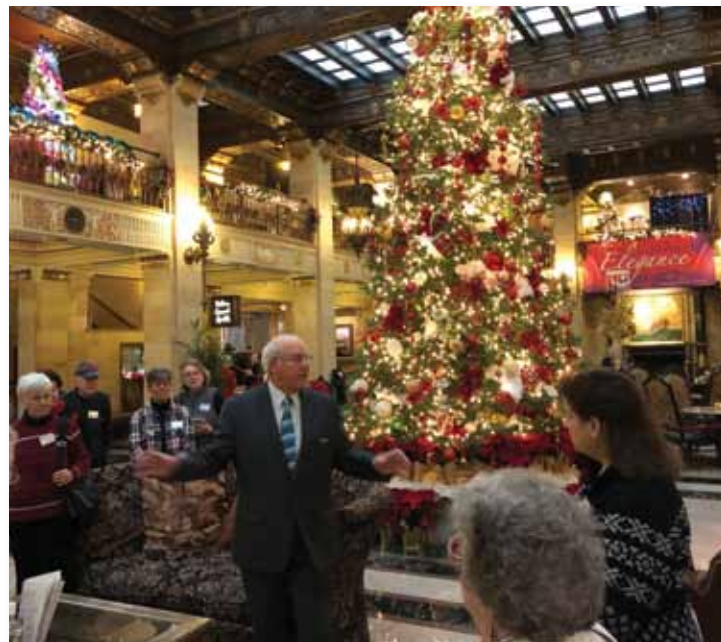
Learn about the history of The Davenport on your docent-lead guided tour

Travel east past Coeur d'Alene to the Cataldo Mission. The oldest building in Idaho, it was built by Native Americans and Jesuit Missionaries in 1853. Learn the story of the "black robes," and in the