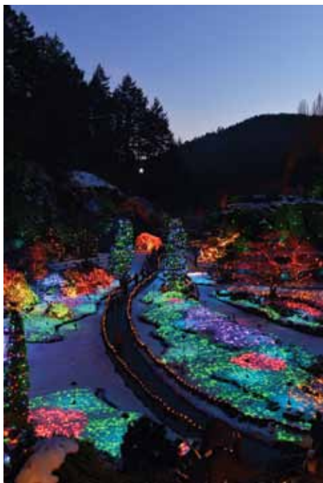
The Christmas lights at Butchart Gardens absolutely sparkle

2. A narrated driving tour this morning gets you acquainted. Make note of the shops you want to visit! But first, warm up with a spot of tea, finger sandwiches and decadent petit fours at the famed Empress Hotel. It's a meal fit for a queen! Learn about early Christmas traditions brought by immigrants at the award-winning Royal B.C. Museum, and stroll the lavishly decorated replica streets of Old Town Victoria. The remainder of the