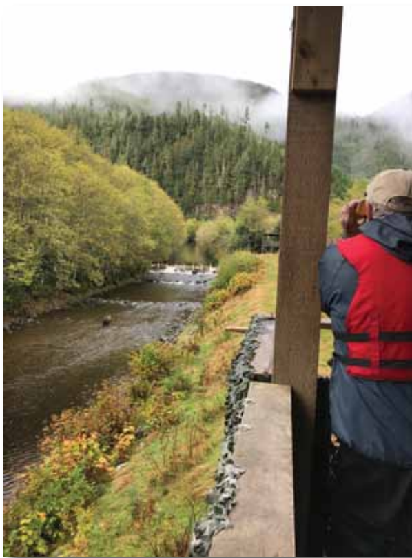
While perched in an elevated viewing stand, watch as the bears and eagles dine on salmon below

$2575 p.p./dbl.occ., $2895 single Save $40 until April 13