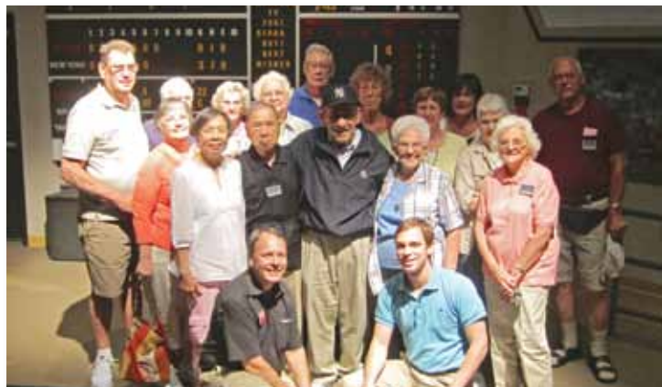
A blast from our baseball tour past – In 2010, we were greeted at his museum by a baseball legend, Yogi Berra. What an incredible moment.

11 Days: $5280 p.p./dbl.occ., $6285 single