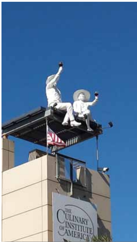
Enjoy seasonally inspired culinary delights at the iconic Napa site