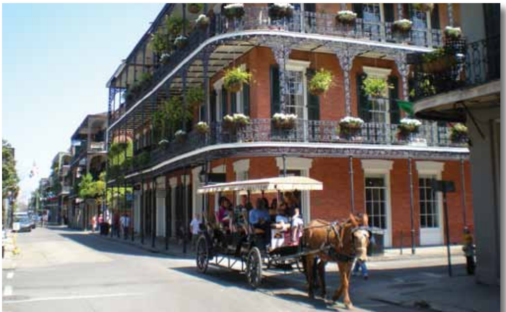
Life moves a little slower in New Orleans