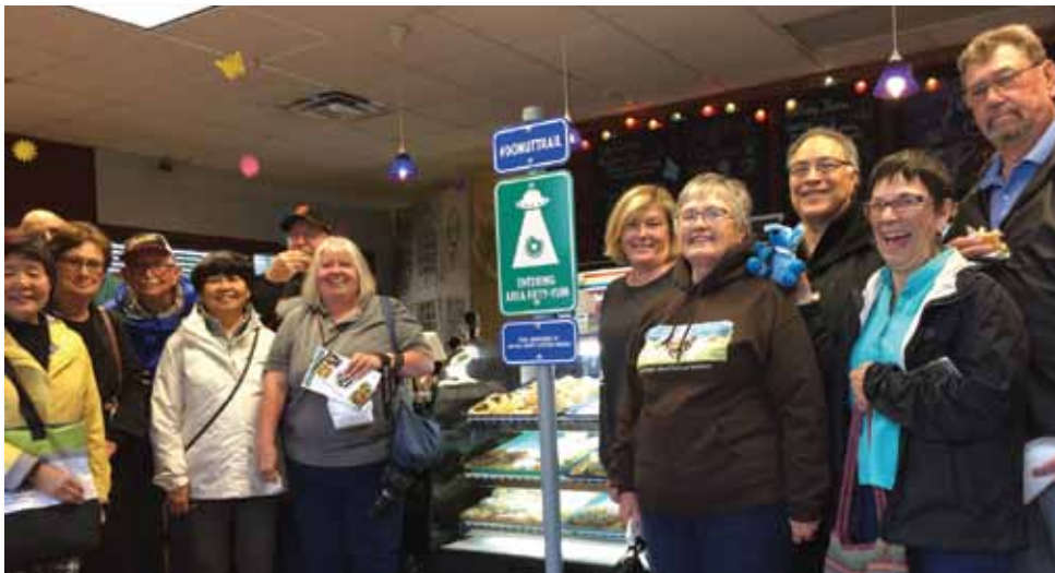
Our recent baseball trip made a side trip on the Donut Trail near Cincinnati. Yum and double yum!