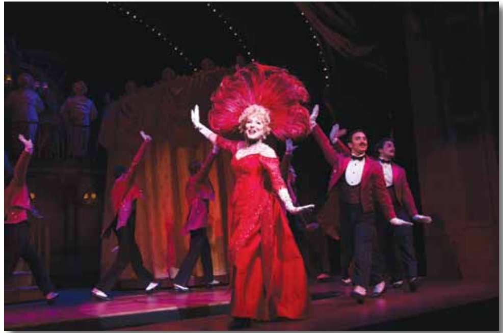
The "Devine Miss M" returns to Broadway in "Hello, Dolly!"

I am thrilled to let you know I have 32 mezzanine (first balcony) seats to the Wednesday, November 22 performance. If you've ever considered joining us on our annual pilgrimage to Thanksgiving in New York , there's never been a better time! You can find the day-by-day itinerary in the April/ May edition of our newsletter online, or a brief description is in the calendar in the back of this newsletter. We have a number of new additions this year. Here are a few highlights: