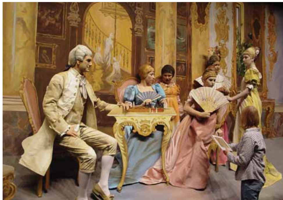
Is that painting alive? Find out at the Laguna Pageant of the Masters...

*Prices include a $100 tax-deductible donation to Sacramento's National Public Radio (NPR) station.