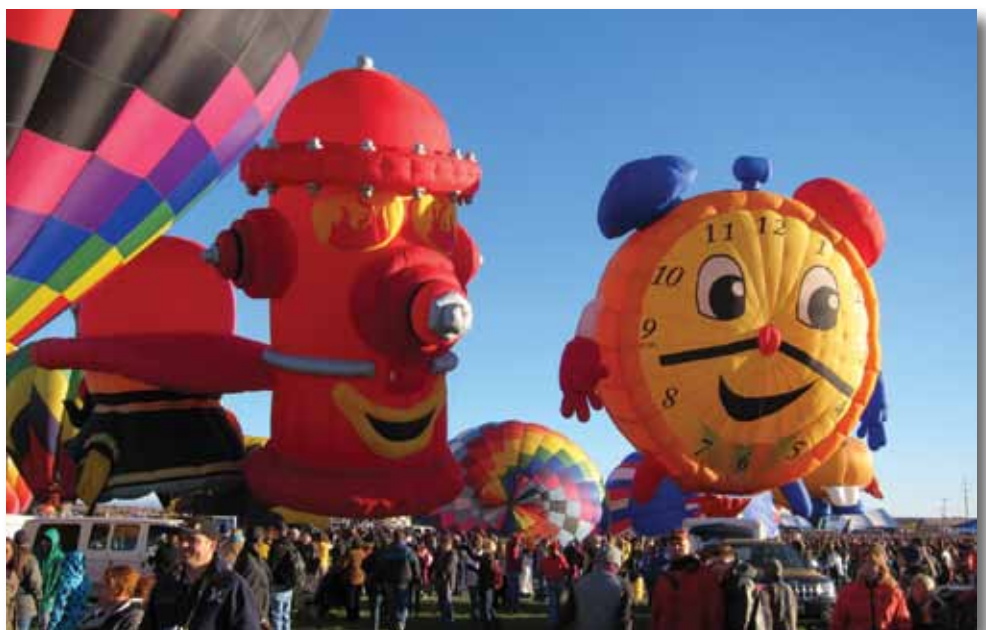
Colorful hot air balloons fill the skies above Albuquerque in October

This is truly an incredible opportunity and a must on your bucket list if you are a nature enthusiast! Our 2016 group of adventurers didn't want to leave! Knight Inlet is home to one of the largest concentrations of Grizzly Bears in British Columbia. With ample seafood and other food sources, these Grizzlies are magnificent! We will be visiting during the fall salmon run so we will be walking out to viewing platforms in order to see the bears filling up on fresh salmon. Bring your cameras and binoculars for spectacular viewing! This is a Sports Leisure Vacations exclusive , as we are the only tour operator with the premier fall viewing season availability!