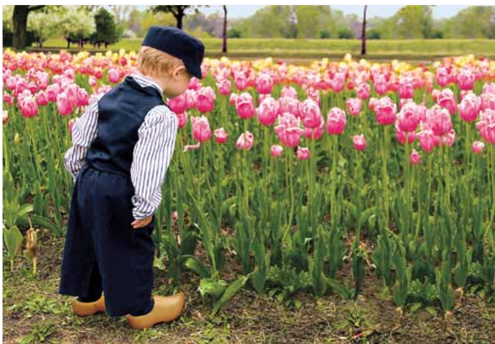
Is this your vision of Holland and the Netherlands?

This vacation requires a valid passport!