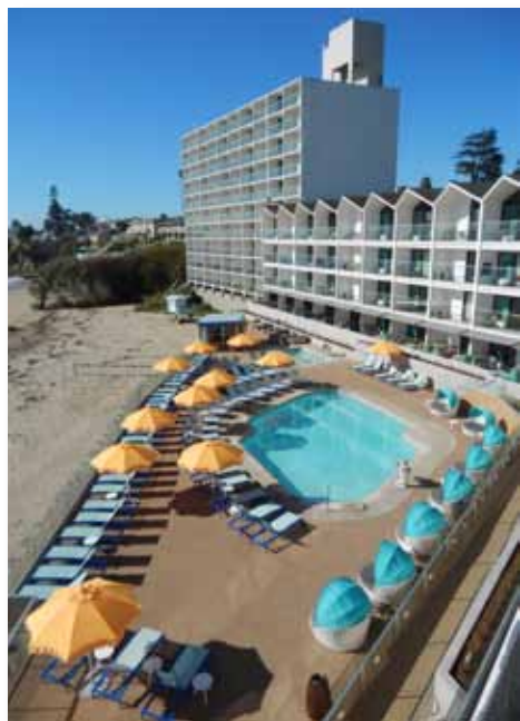
The Dream Inn, on the beach in Santa Cruz