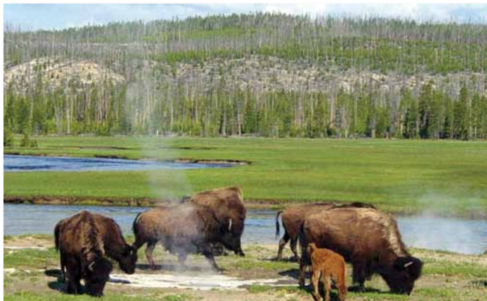
Buffalo and geysers...only in Yellowstone National Park