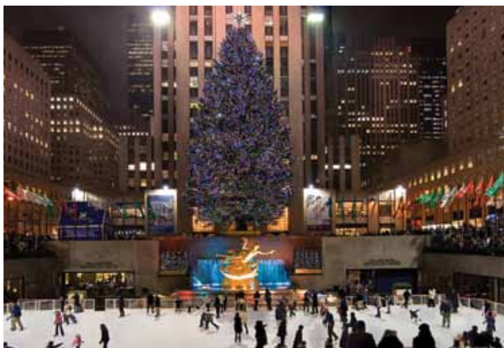
The Christmas Tree in Rockefeller Center is almost as tall as a skyscraper!