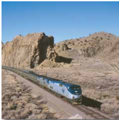
The Sunset Limited winds its way through tumbleweeds and chaparral

Please note: due to new restrictive Amtrak policies, we encourage you to sign up for this tour no later than December 1 as any extra compartments will need to