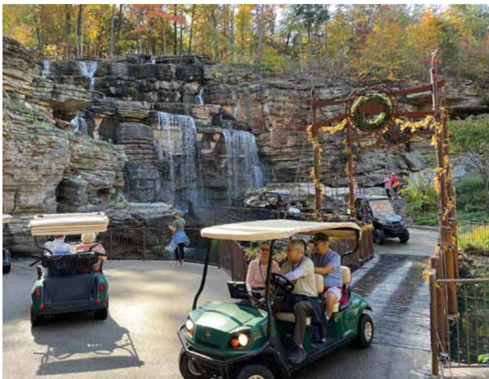
A novel idea: Lost Canyon Nature Trail by golf cart, outside Branson

4. At the Titanic Museum your guided tour lets you experience life on board just