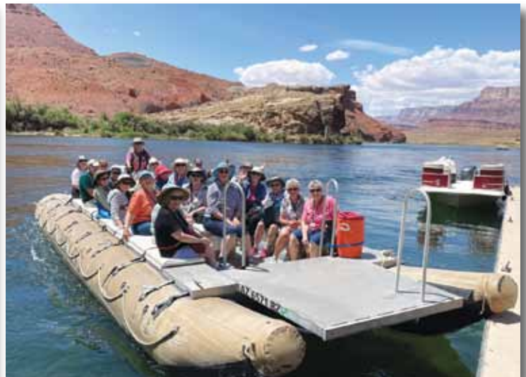
Getting ready for adventure on the Colorado River