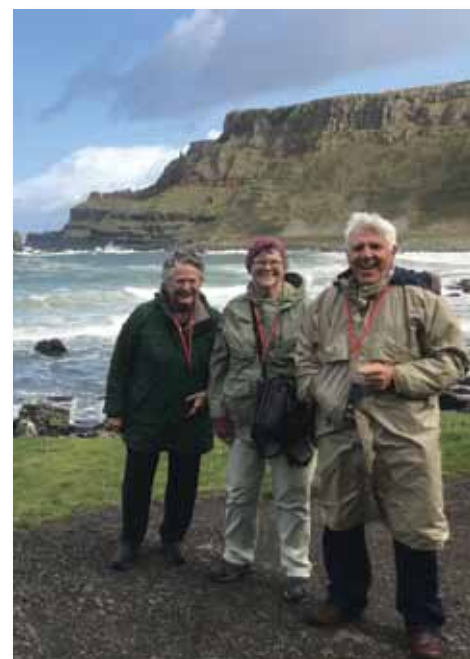
Getting "blown away" on the spectacular coast of Ireland