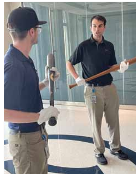
So, would you like to hold a bat used by Aaron Judge? Or one used by "The Babe" himself?

The Space Needle, Seattle City Tour, Tour of West Seattle, Locks Cruise