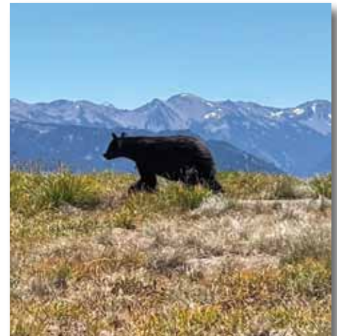
A black bear cub wandering near made us wonder where mama bear might be