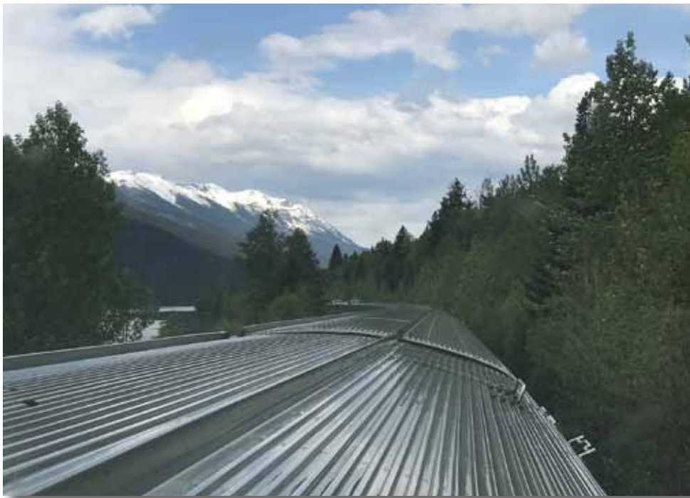
Take in a 360° view from the dome in the Park Car

will have access to the Park Cars with their popular sightseeing domes. VIA Rail's staff will be on hand during every mile of your journey to assist you.