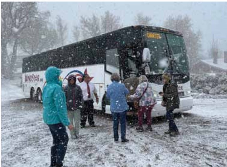
The Great Belmont Blizzard had us scrambling to leave town