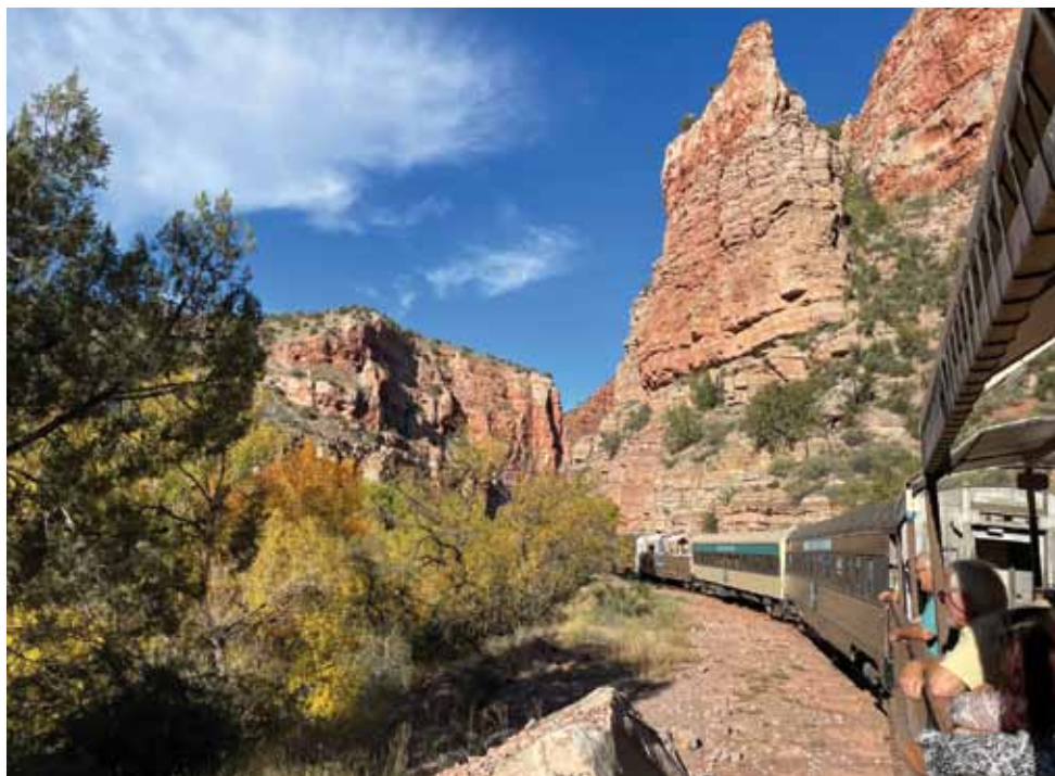
Riding the Verde Canyon Train near Sedona