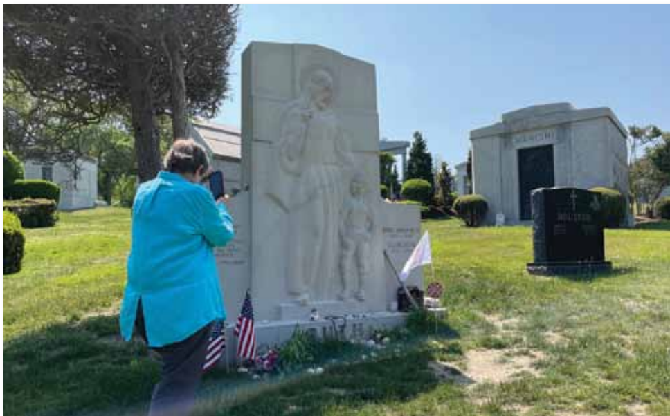
One of our travelers getting a picture of the grave site of Babe Ruth

Note seats for two games, June 1 and Sept. 5 , are located on the Club Level. This is one level above where we usually sit. This is a bit of an experiment. Access to the Club Level is limited to those who hold tickets. The crowds are smaller, the rest room lines (for the ladies) shorter, the facilities are cleaner and the food stand lines are also shorter. Elevators or ramps will take you up there. Tyler and Mark checked out these seats and thought them worthy of a try. Ultimately, your opinion will determine if we return to that area next season.