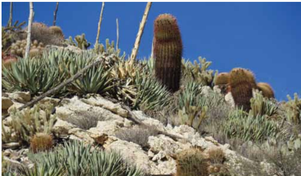
The beauty of the desert comes in many shapes, textures and colors