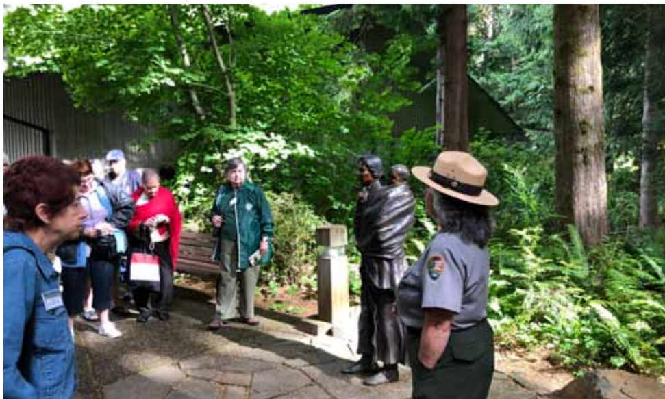
The Sacagawea statue and a local ranger tell stories of bravery and fortitude at the Lewis and Clark National Historical Park