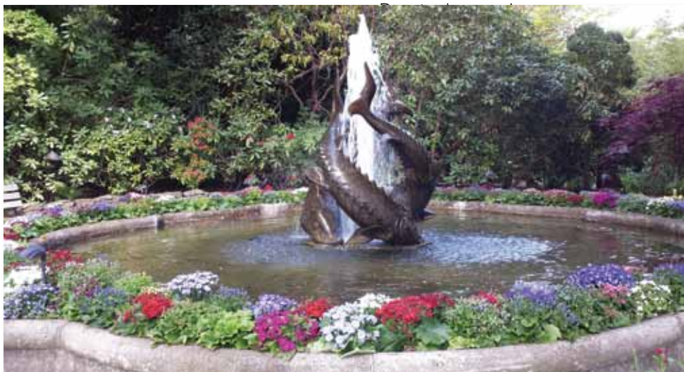
Watch the water splash over the statue at the Japanese Garden... one of many themed gardens at Butchart