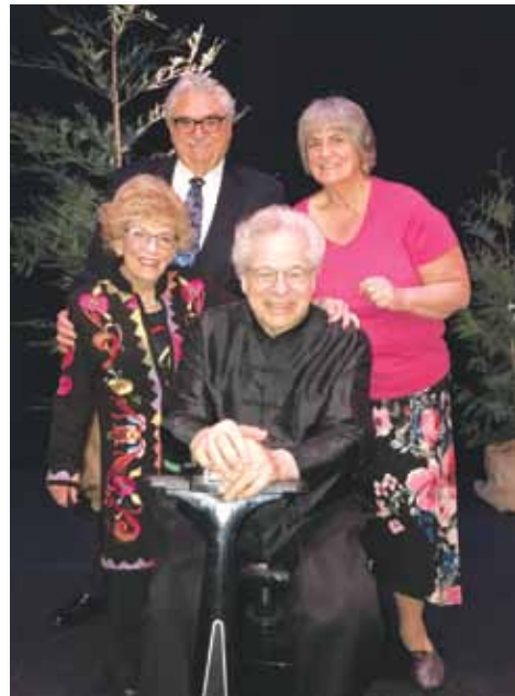
Sports Leisure Travelers had an opportunity for pictures with one of the world's most famous performers, Itzhak Perlman, prior to his show in Modesto.

When you see the show, it's likely you might come away saying, "I'd love to go