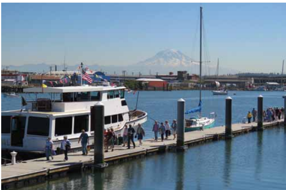
Sports Leisure travelers board the Virginia V in Tacoma with Mt. Rainier as a backdrop

2. Mt. Rainier, dubbed "the mountain" by the locals, dominates the skyline on a clear day. As a matter of fact, locals often say "the mountain is out today". Ascending to 14,410 feet above sea level, this iconic glacier-topped mountain is legendary with mountain climbers and casual visitors. Passing by alpine meadows, and streams filled with crystal clear glacial water, travel to Paradise. The Jackson Visitors Center hosts films and exhibits relevant to this mountain, which by the way is an active volcano; and the Paradise Inn offers travelers a view of Mt. Rainier as a breathtaking backdrop