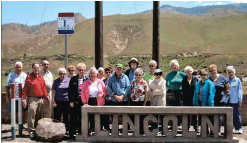
SLV travelers have explored many of the historic old highways over the years... small towns, local folks, good eats and treats can be found along the way

The next day take a guided tour of the historic Thunderbird Lodge near Incline Village, the home of George Whittell, Jr., one of California's multi-millionaire families; an included lunch and a quick stop in Truckee