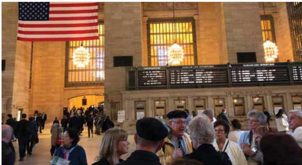
Visit Grand Central Station and catch the subway downtown on a walking tour of NYC