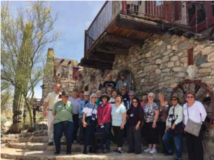
We simply had to include a stop at the "The Mystery House" in Arizona