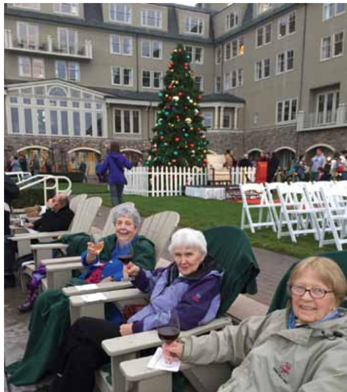
Christmas cheer can be found overlooking the ocean at the elegant Ritz Carlton Half Moon Bay