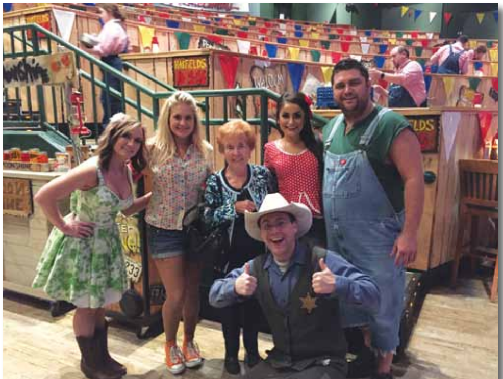
Entertainment Pigeon Forge-style is nothing but a whole lot of fun!