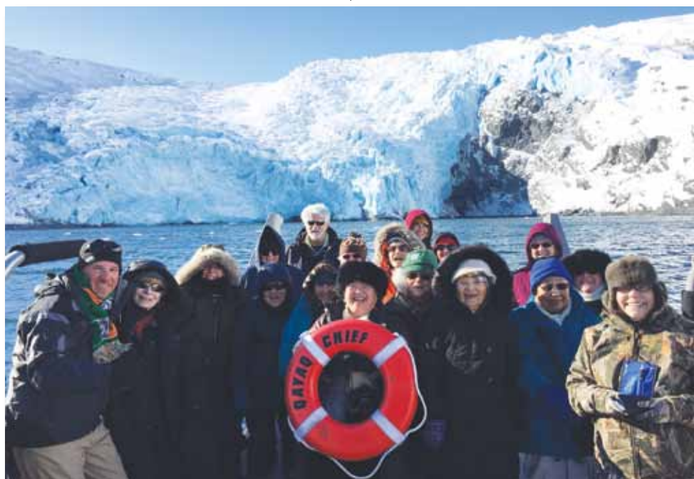
Alaska in March? It's cold but a great time to see Blackstone Glacier and the Aurora Borealis!

$4790 p.p./dbl.occ., $5195 single Save $125 until September 12*