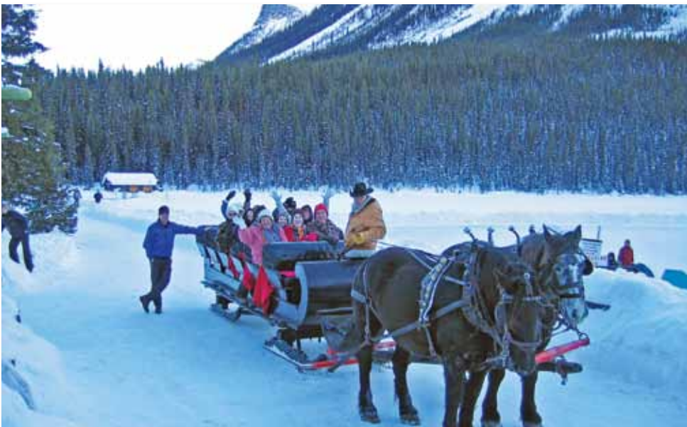
Dashing through the snow near Lake Louise in Alberta

*Legal size dimensions for a carry on bag are 9 inches (deep) x 14 inches (across) x 22 inches long, including wheels and handles.