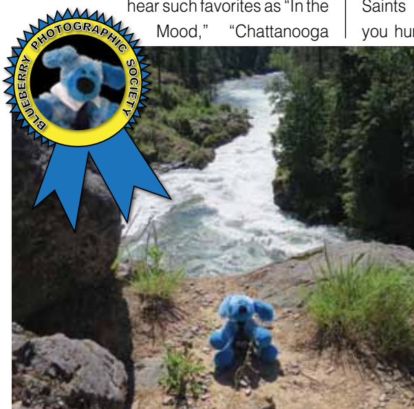
Blueberry takes a break during a hike around the village of Chase, located in British Columbia's Interior, during "Mystery Tours Are OK, Eh?" Congrats to Donna Sutton for her scenic photo!

When you receive your itinerary/confirmation for a trip, check to see if a meal choice is needed and take a minute to make your selection by calling or emailing our office or returning your choice with your payment. Thank you.