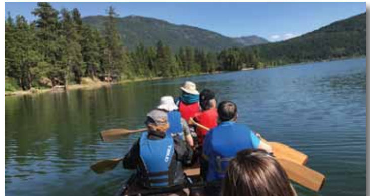
These travelers discovered that even being "up a creek" with a paddle is good for a laugh