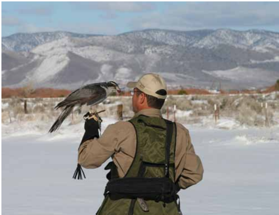
Birds of a feather flock together during the Eagles and Agriculture Festival in Carson Valley

$950 p.p./dbl.occ., $1070 single Save $35 until September 12*