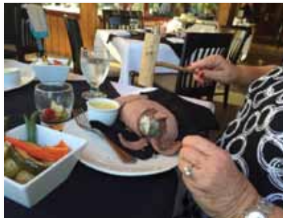
At Quaaout Lodge, folks had to work for their dinner... clay baked salmon, with hammer included... just another example of exploring new cultures

The highlight of our mystery trip to the Lakes of the Okanagan in British Columbia in June was the group paddle on Little Lake Shuswap. Imagine 12 people trying to paddle in sync... We laughed so hard as our canoe went around in circles! The views were stunning with Lake Okanagan (over 100 miles in length) dominating, while other smaller lakes dot the scenery. A forested shoreline provided an intimate setting for the Quaaout Lodge, our home for two nights. We dined on amazing clay baked salmon, visited a couple of farms to taste local products, and sipped wine at the elegant Quails Gate Winery. It was a real treat to meet folks so proud of their heritage: the First Nation staff at the lodge, the third generation farmer's daughter, and a recent immigrant. It was definitely a farm-to-fork-to-fun adventure off the beaten path!