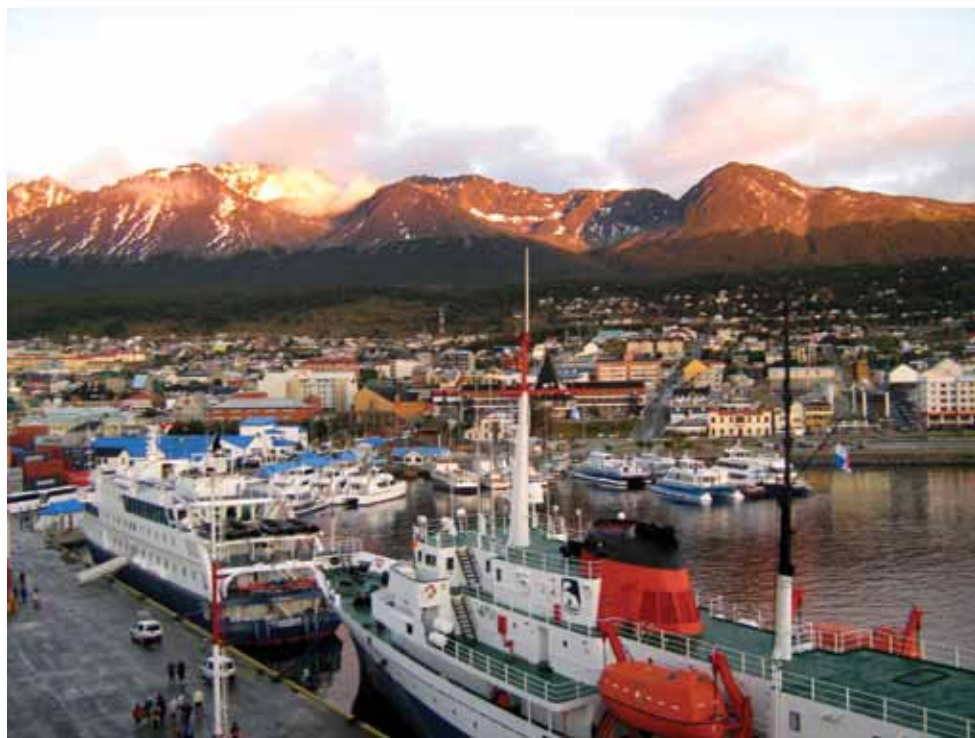
Ushuaia, your colorful port of call before passing Cape Horn through the Strait of Magellan

Visit us 24/7 on the web at: www.sportsleisure.com