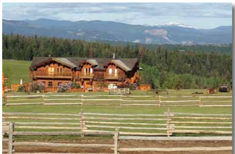
SLV travels to the end of the road to find unique and breathtaking experiences just for you