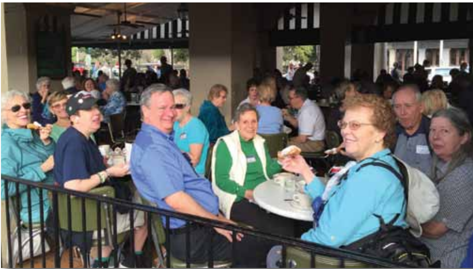
Savor a fresh, hot beignet and chicory coffee at world-famous Cafe du Monde