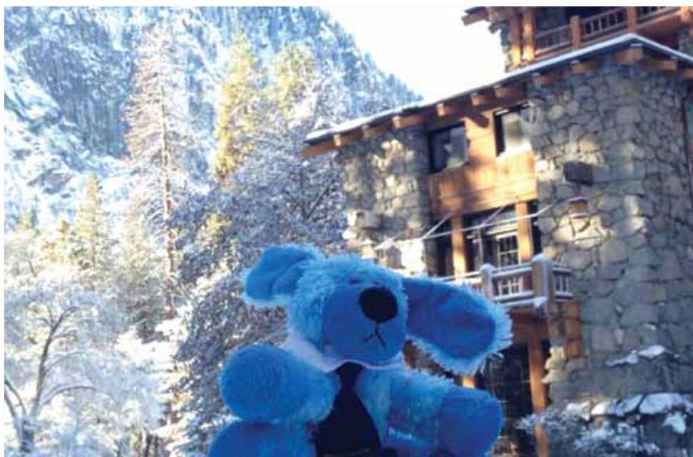
Blueberry at the Ahwahnee Hotel – Yosemite National Park

2. Learn more about winter in Yosemite and enjoy the spectacular views as you explore from one end of the valley to the other from