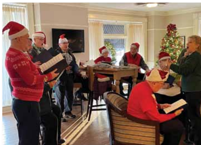
A Christmas concert at Gettysburg College