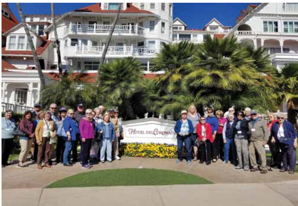
Let's go back to San Diego and have lunch at the Hotel Del...