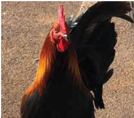
One of Kauai's most famous residents waits to welcome you... only problem is their wake up call comes at 5am!