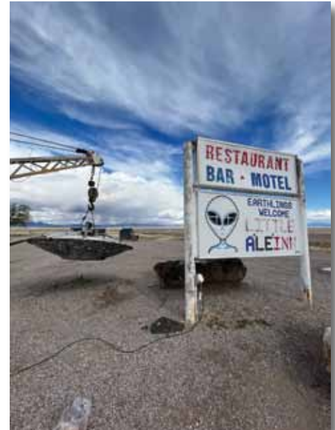
In rural Nevada, there are spaceships and a'le'inns everywhere