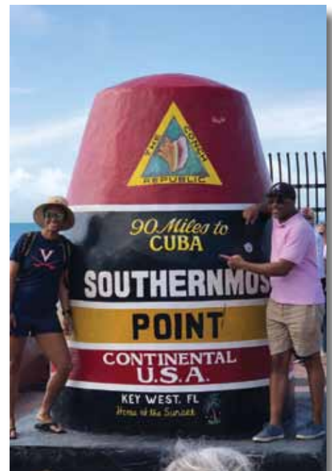
Key West brags of having the point furthest south in the continental 48 states