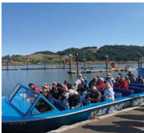
That's our gang on the Rogue River Jet Boat