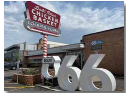
Our first meal stop on old Route 66 outside of Chicago

To redeem points, simply advise us when making a tour payment by telephone or in person. It will be done instantaneously with no paperwork required. You may also redeem your points and take the award in the form of a Travel Certificate. The certificate can be issued in your name or in the name of another should you wish to give the gift of travel.