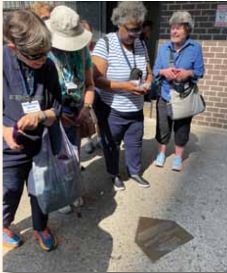
Last summer, our baseball travels took us to the site of Ebbets Field, home of the Brooklyn Dodgers. Here, our gang snaps a picture of where home plate used to be at the ballpark

The Mariners have a beautiful ballpark downtown. Spend two nights, see three games, and get just a bit of Seattle sightseeing into your itinerary. Like a visit to the Space Needle, time to explore Pike Place Market, the Chihuly Museum of Glass and Sunday Brunch. Oh, and tickets to all three Giants/Mariners games. This package would also be available without the baseball tickets, and with alternate activities. When you indicate interest, please tell us baseball or no baseball.