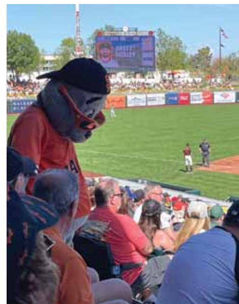
Giants mascot Lou Seal looks for his seat