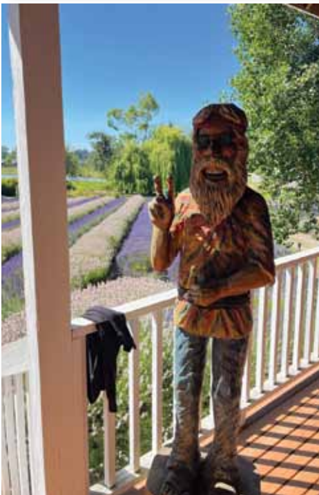
Hi there. Welcome to the lavender farm. Sure smells good around here...