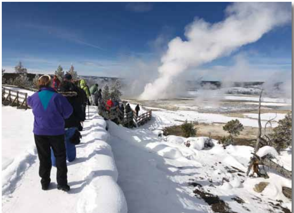
Yellowstone National Park in the winter will take your breath away

1. Travel through the Central Valley to Yosemite National Park and to the historic Ahwahnee Hotel, built in 1926. Sunday Brunch is presented in the Ahwahnee Dining