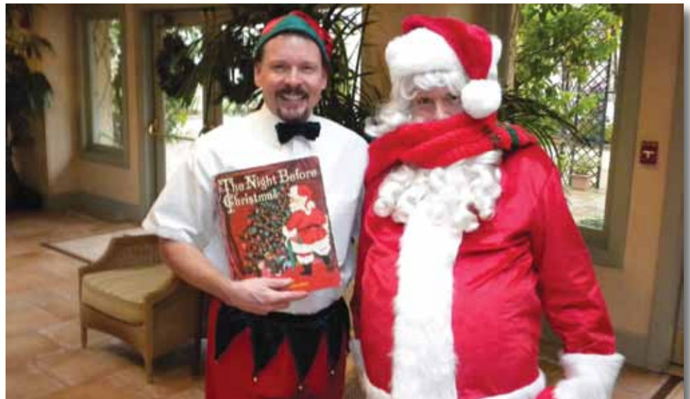
Santa and his elf look rather familiar, wouldn't you say?

1. Start your holiday like all good vacations should – by sleeping in! The California Zephyr leaves the Amtrak Station at half past 11, arriving in Reno at 4 p.m. Whether there’s snow or not the trip through the Sierra