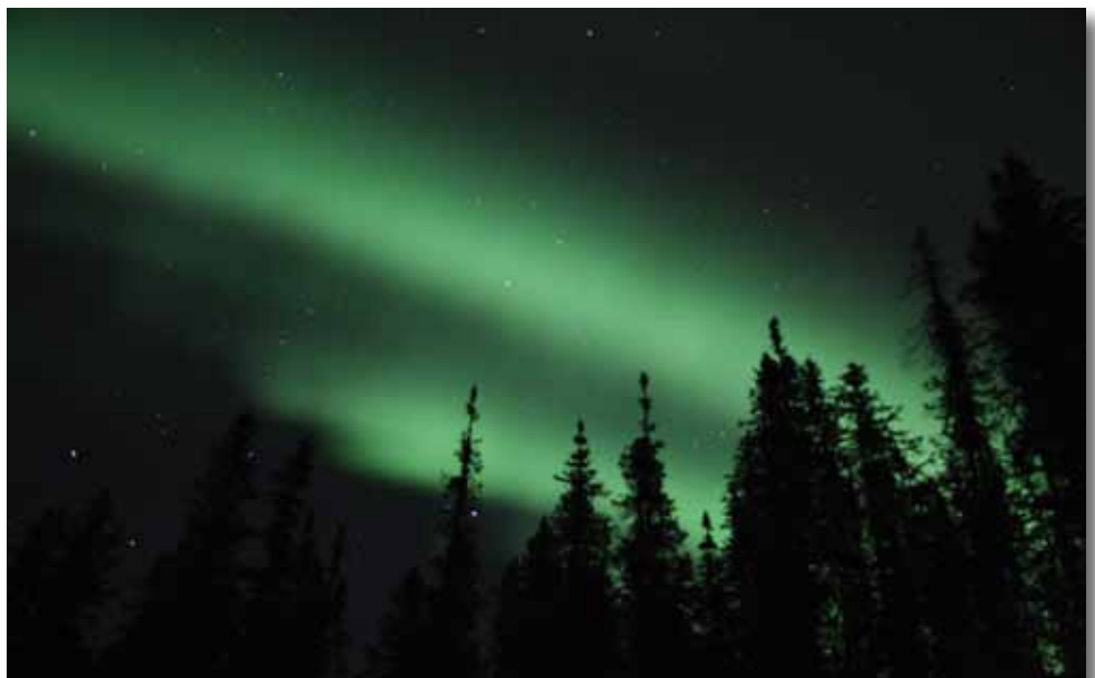
The Northern Lights near Fairbanks are nothing short of amazing