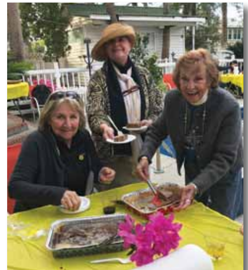
Serving up Toot's famous prune cake

$4260 p.p./dbl.occ., $4820 single $ave $75 until August 31