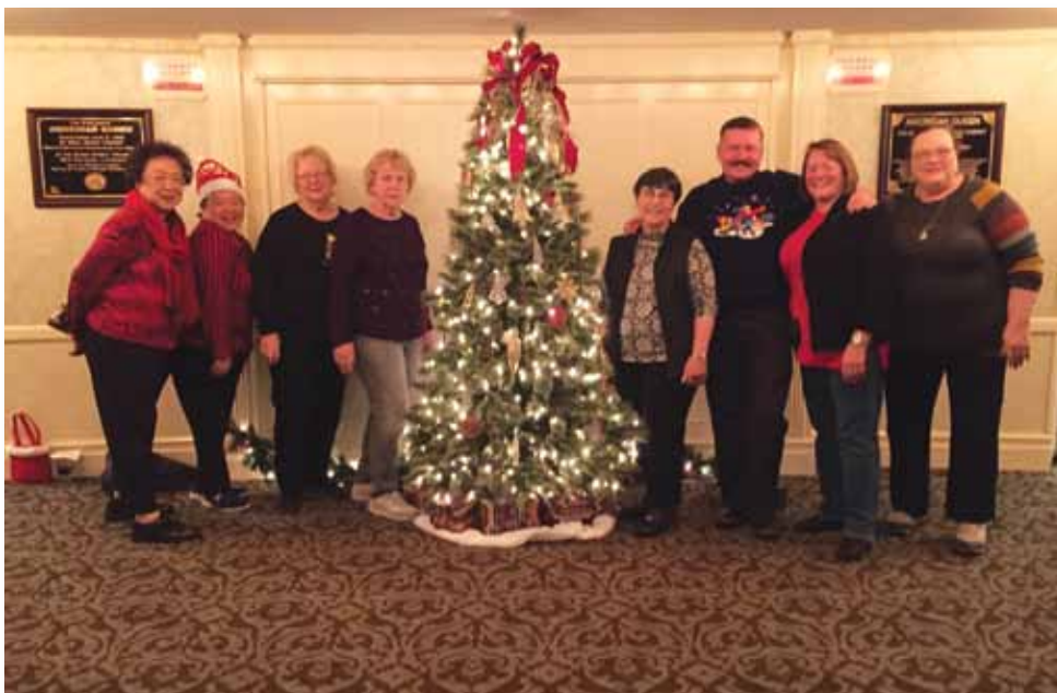
The holidays are best spent with friends!

1. Experience the beauty of the Sierra Nevada Mountains in winter as you travel along Highway 50 to the south shore of beautiful Lake Tahoe. Pause for lunch before traveling east to Carson Valley and the town of Minden in Nevada. The annual Eagles and Agriculture gathering focuses on the