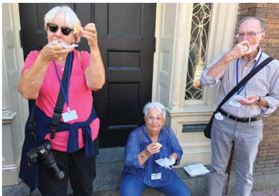
Sweet treats are the perfect end to a great day of touring