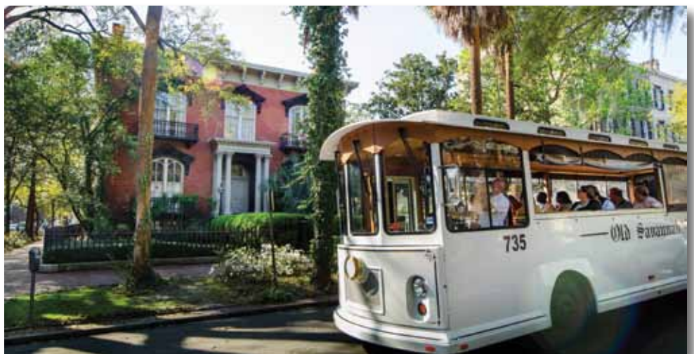
A morning trolley tour passes sites related to Savannah's rich past and present