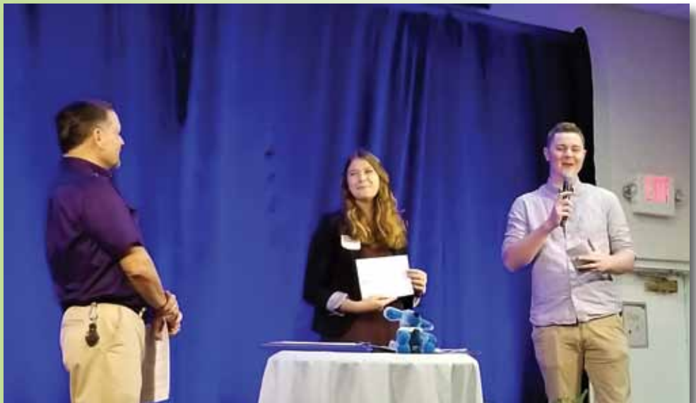
Each year, at Tour Preview Day, we honor the next generation of future travelers by awarding scholarship(s) to assist them in their journey. The recipients are generally relatives or friends of Travel Club Members. See The Barber Pole on page 3 for details on how to apply.