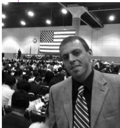
One of the newest citizens of these United States