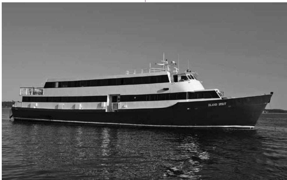
The Island Spirit is your home away from home as you cruise up the mighty Columbia River

This vacation requires a valid passport! Save $100 until December 8