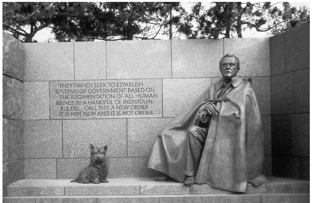
Explore the monuments of Washington DC, including the FDR Memorial