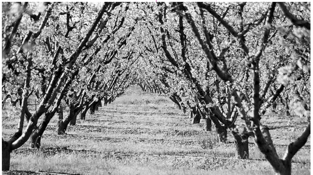
Marvel at the orchards along the Blossom Trail