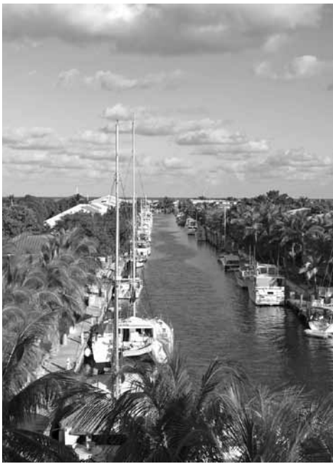
Sailing away in Key Largo