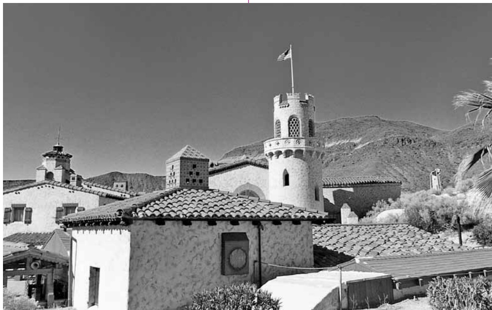
Scotty's Castle is a much visited spot in Death Valley

$1485 p.p./dbl.occ., $1725 single Save $25 until December 8