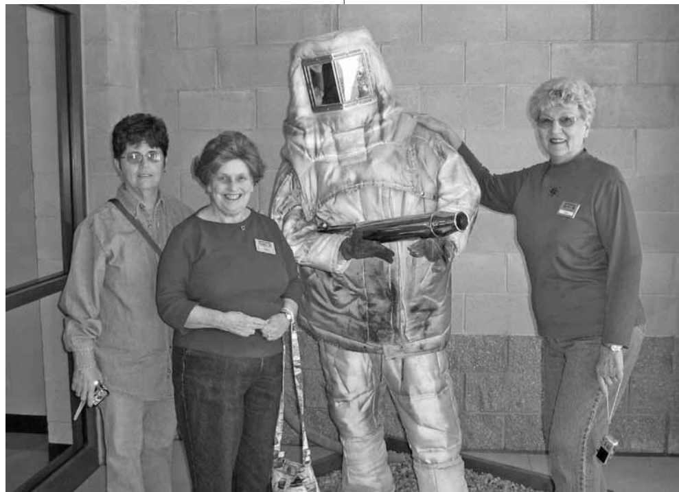
Explore the Nevada Fire Science Academy in Elko and meet a new friend