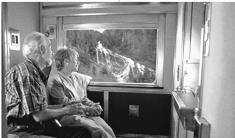
Watch the spectacular scenery of Canada as it moves past the window of your private compartment on VIA Rail